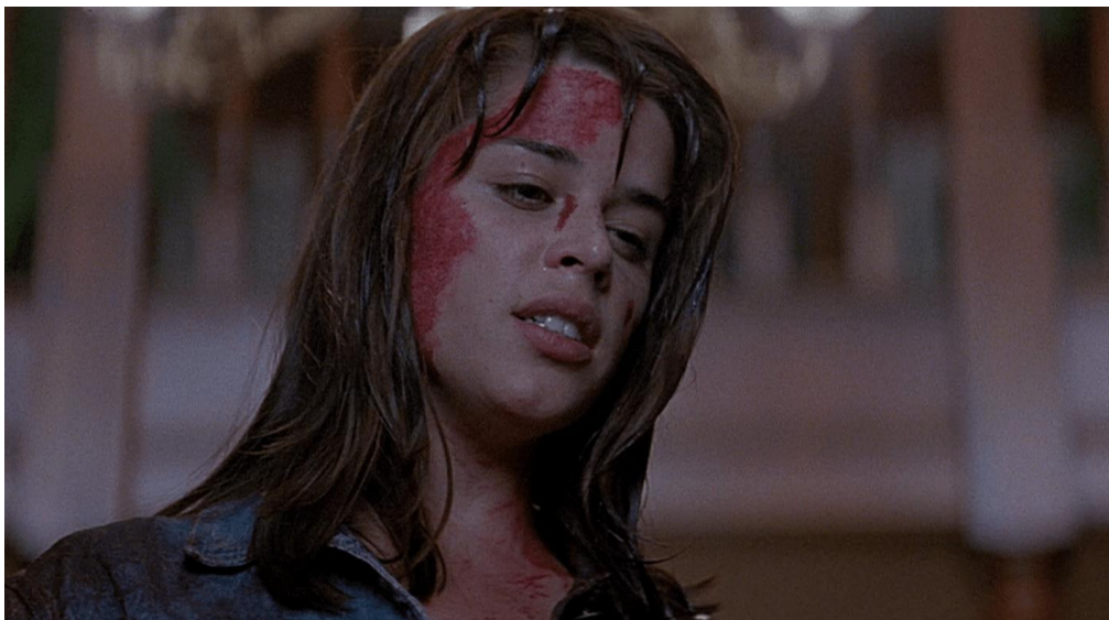
Neve Campbell in Scream (1996)

With the series, I question the morals and problematic nature of the final girl. The final girl as a concept influenced my perception of young girls since I watched many slasher films. Through putting myself in the role of (re)creator of these images and working with models I know personally, I explore these stereotypes by creating them in an amateur studio setting. By putting myself in the role of director of photography, I can literally build up the character using attributes, make up, lightning and my camera. In that way, the aesthetics and characteristics of the image become clear to me; readable, you could say. The construction of the image helps me to understand my own prejudices and the attraction I felt towards (young) women. The final girl stereotype has, in a way, shaped my male gaze. It has partly determined what I perceive as attractive in females. I edited the